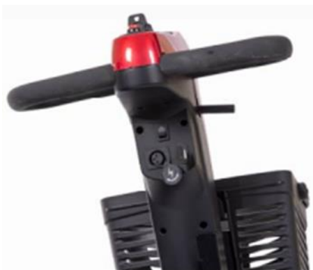
1 Amp USB Charging Port